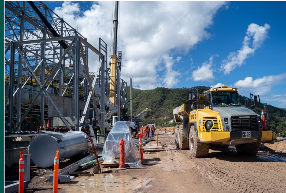
Structural steel installation well advanced