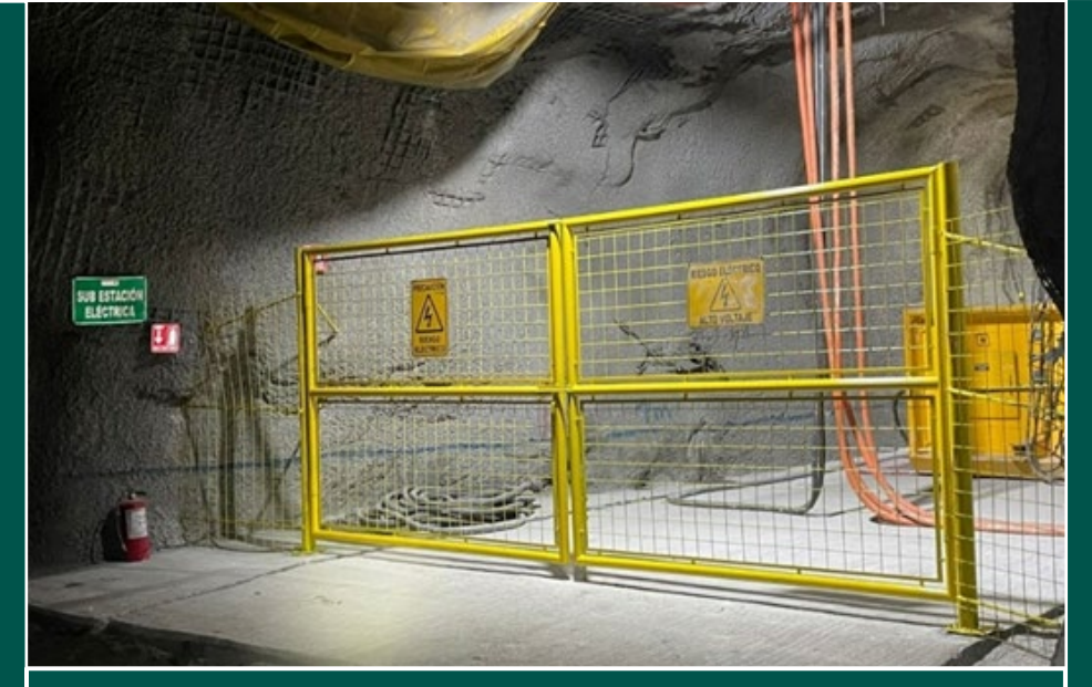
Installation of electrical substations