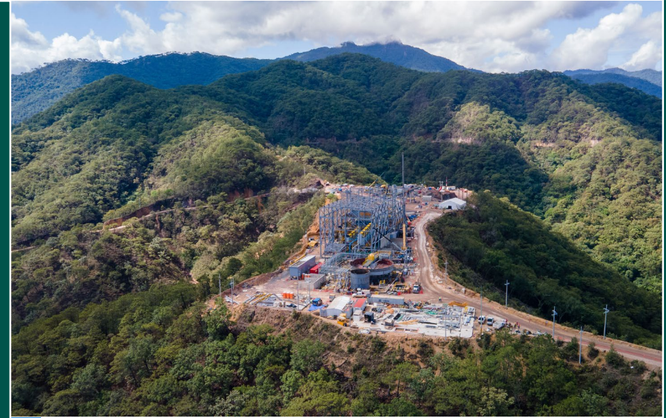
Erection of the assay lab and mill maintenance shop will commence in Q3.