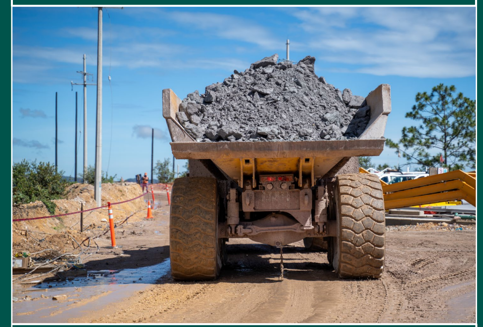
Hauling waste from Portal 1 to waste dump