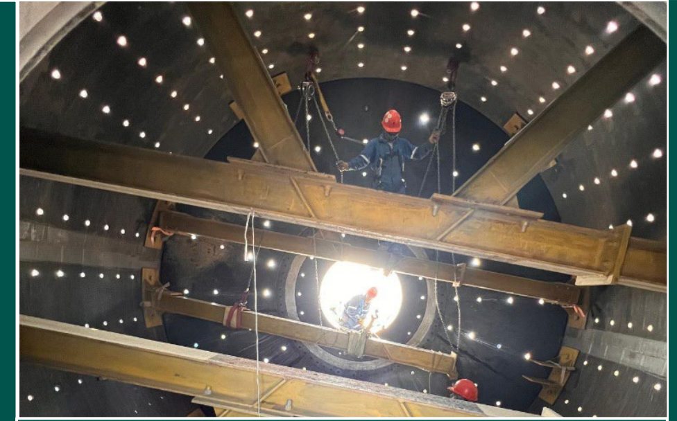
Inside the SAG mill prior to installing liners