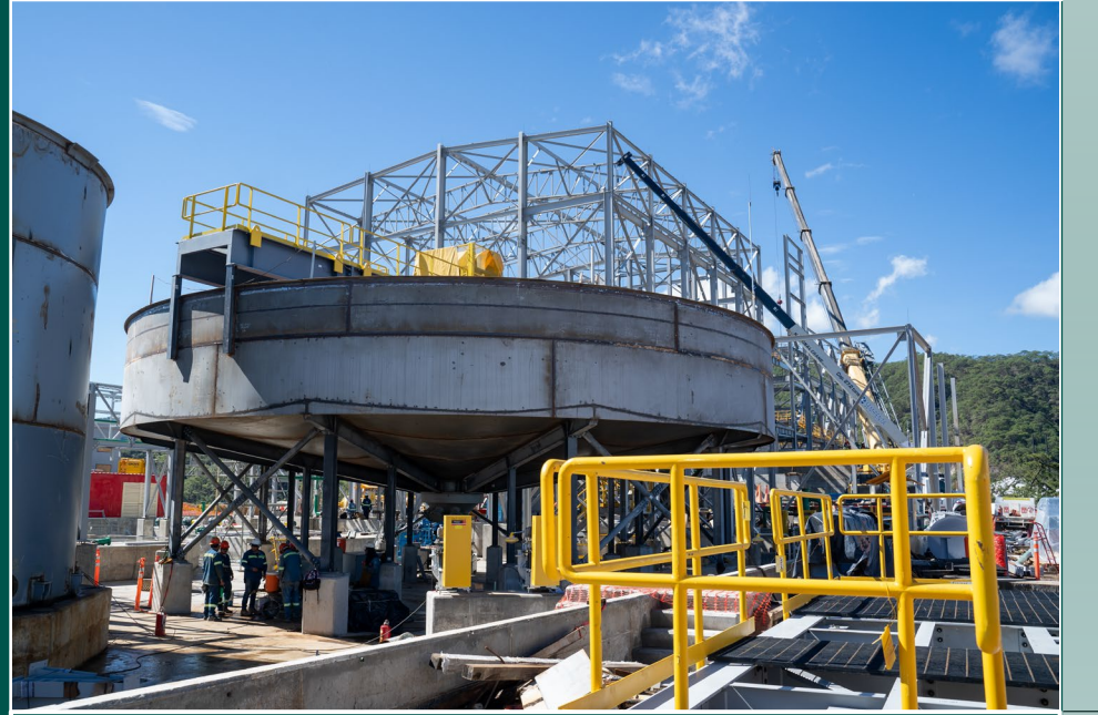
Tailing thickener tank