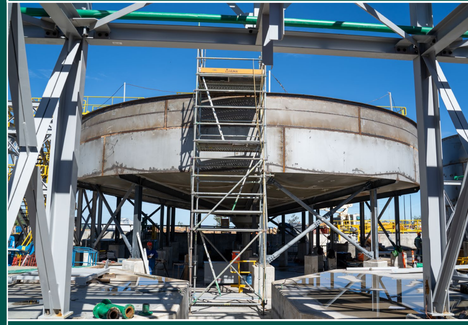
Tailing thickener tank