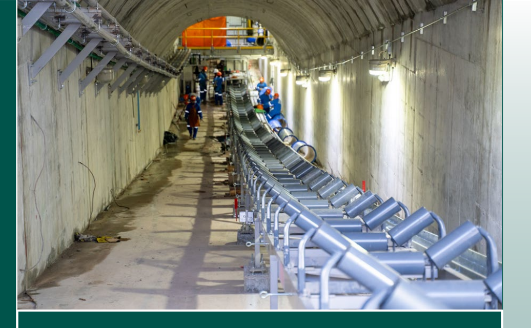
Inside view of the Coarse ore stockpile reclaim tunnel towards the feeder