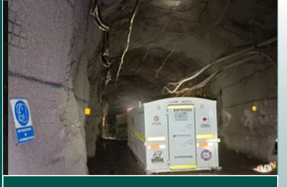
Installation of the rescue chambers