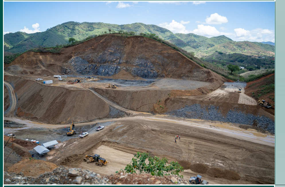
Above lower platform and filtered tailing embankment