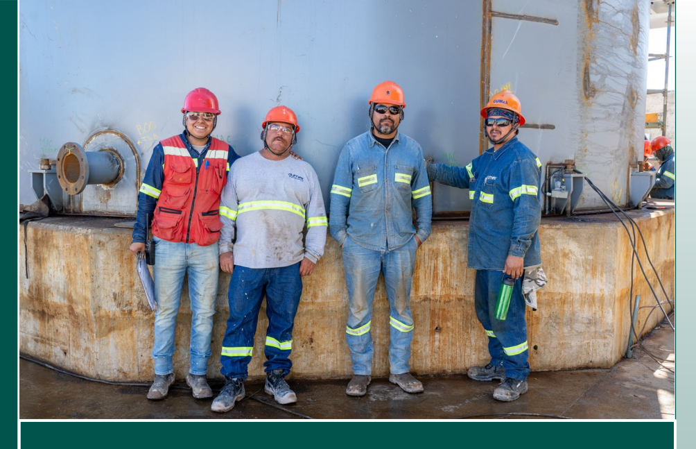
Experienced staff in the thickener area