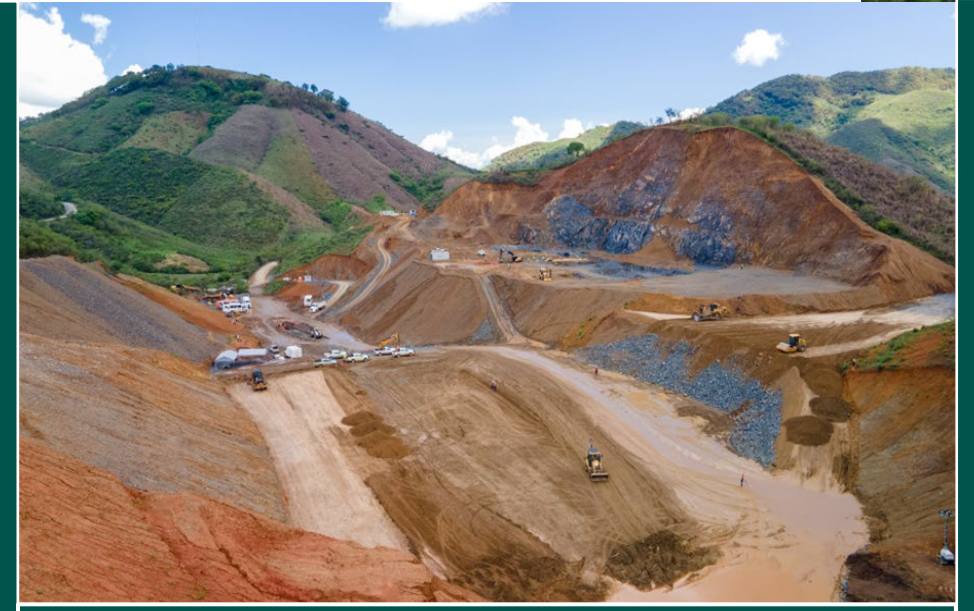
Above lower platform and filtered tailing storage facility