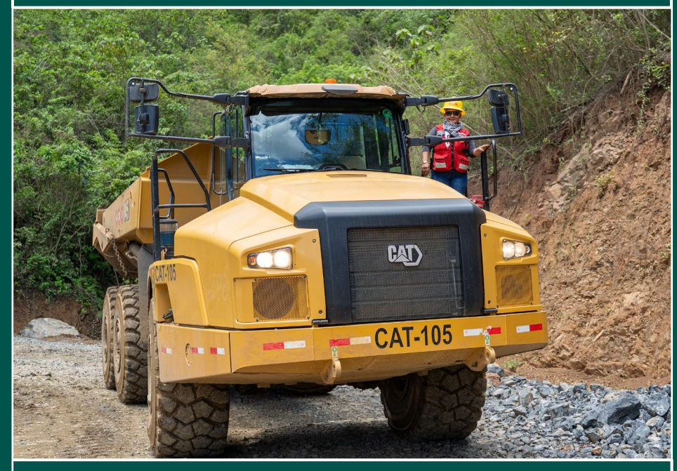
Contractor for earth moving