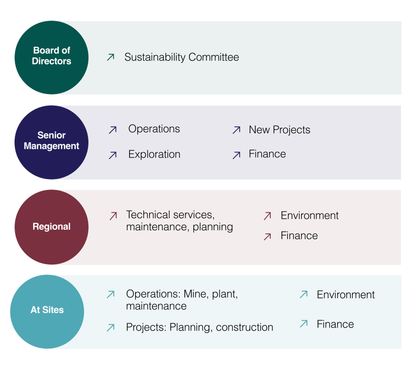
Figure 2: Governance structure with regards to climate change at Endeavour Silver

Climate risk management is part of our broader sustainability governance. We continue to embed climate risk management across the company, from the Board of Directors (Board) through to each site.