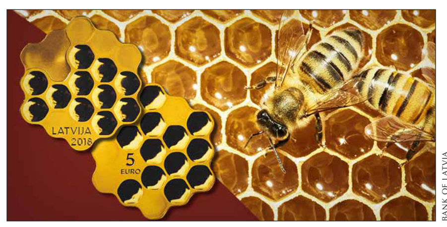
This gold-plated silver coin, shaped like a honeycomb, was named Coin of the Year.

The coin weighs 16.50 grams and contains .925 silver with .995 gold.