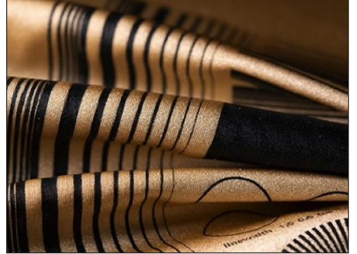
Stretchable sensors containing nanosilver and silicone allow greater flexibility and scalable production.

Silver is not the only metal that the engineers have added to silicone. They are also adding iron nanoparticles in differing amounts that offer magnetic properties. By oscillating electrical current through the silicone wire, it can act like a magnet which can be used as a switch.